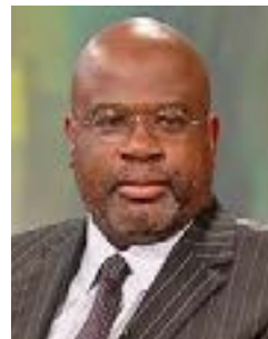
Christopher A. Darden

Co-Sponsored by the State Bar of California Criminal Law Section